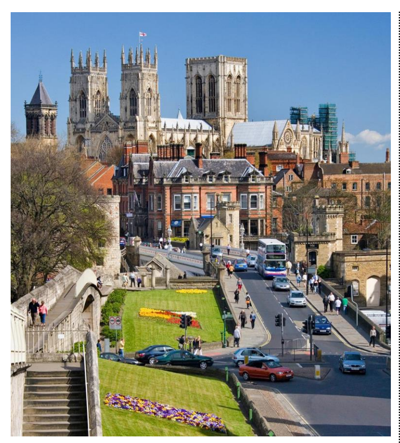
10 Days • 12 Meals: 8 Breakfasts, 4 Dinners

HIGHLIGHTS... Edinburgh Castle, York, Chester, Conwy Castle, Stratford-upon-Avon, Oxford, Choice on Tour: Ashmolean Museum or Oxford Walking Tour, London