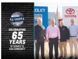
Dan Hecht Chevrolet-Toyota celebrated 65 years.