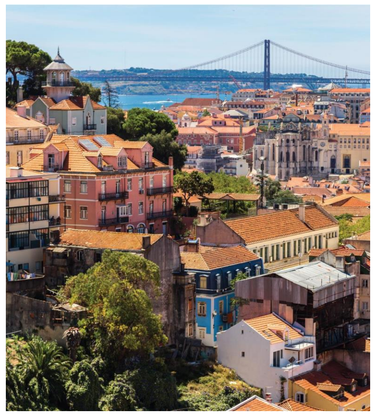
10 Days • 13 Meals: 8 Breakfasts, 2 Lunches, 3 Dinners

HIGHLIGHTS... Portuguese Riviera, Lisbon, Belém, Obidos, Sintra, Arraiolos, Cork Factory, Evora, Winery Visit, Alentejo, Monsaraz, Lagos, Algarve, Faro, Tavira, 4 UNESCO World Heritage Sites, Azeitao