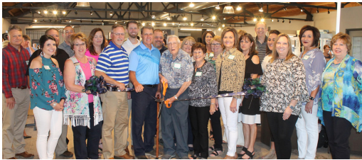
Ribbon cutting at Wright at Home Interiors