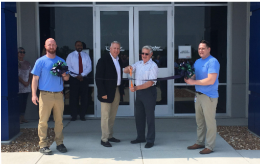
Ryder Systems ribbon cutting