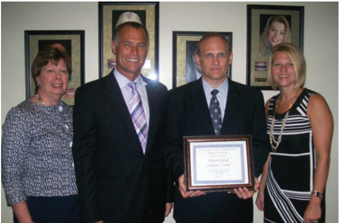
JUNE - Heartland Dental Care