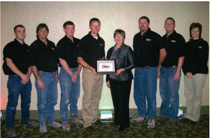
DECEMBER - Probst Auto Body