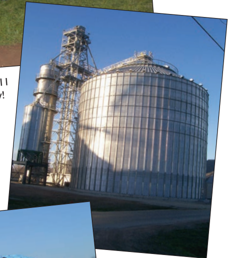
ADM makes multi-million dollar investment in Altamont facility