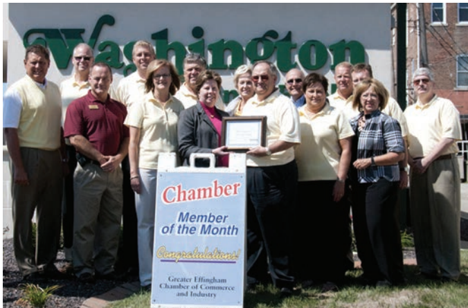
SEPTEMBER - Washington Savings Bank