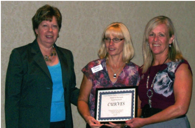
JULY - Curves