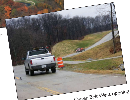
Outer Belt West opening