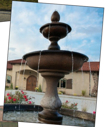
Tuscan Hills Winery