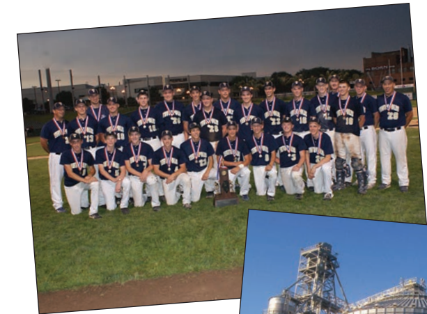
Teutopolis Baseball Team 2011 State Win, 2nd year in a row!