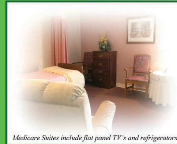
Medicare Suites include flat panel TV's and refrigerators