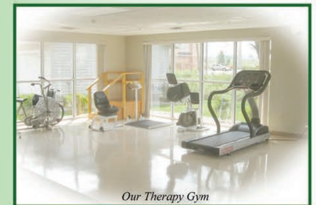
Our Therapy Gym

1115 N. Wenthe, Effingham, IL 62401 Ph. 217-347-7121