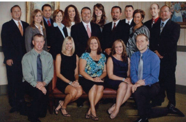
2011 Top 20 Under 40 Recipients