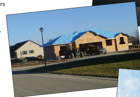
New Housing Development spurs Dieterich growth