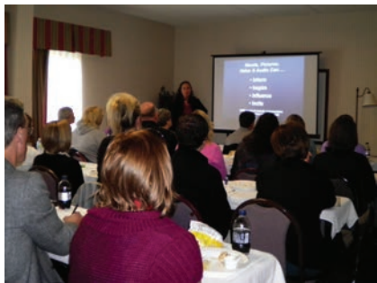
Lunch & Learns offer business insights

Scan this code with your smartphone or go online at www.effinghamchamber.org/findmember.aspx for a complete listing of Chamber members.