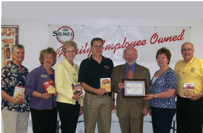
MAY - Siemer Milling Company