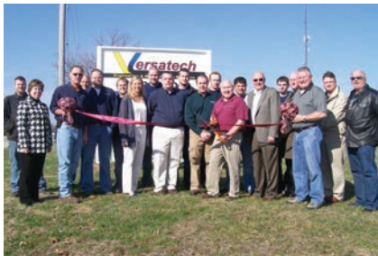
Celebrating Member Business Growth