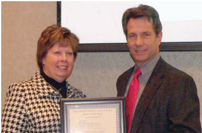
JANUARY - St. Anthony's Memorial Hospital