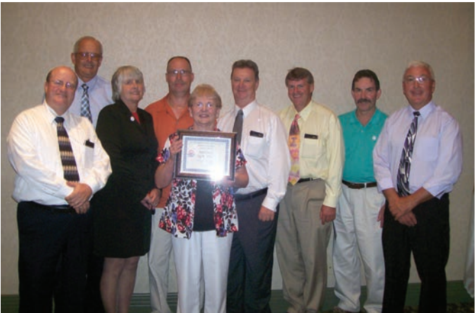
AUGUST - Martin's IGA