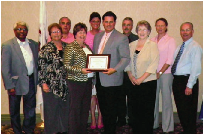
OCTOBER - Heartland Human Services