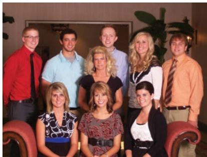
2011 Chamber Scholarship Recipients