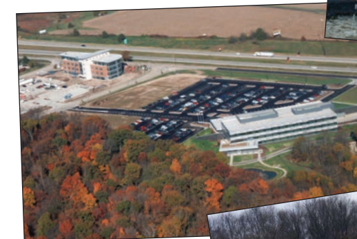
Patterson Technology Center and Midland States Bank Headquarters