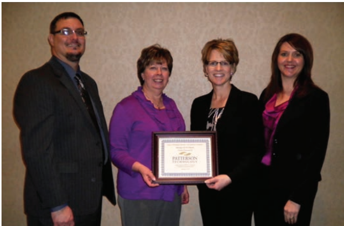
MARCH - Patterson Companies