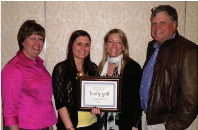
FEBRUARY - Firefly Grill